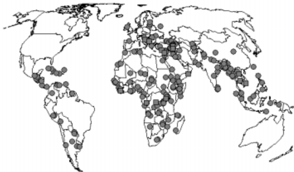
Figure 2. Civil Conflicts, 1946–2000

Adapted from Gleditsch et al. (2001), using software developed by Jan Ketil Rød. For full details on specific armed conflicts, see the Appendix to that paper.